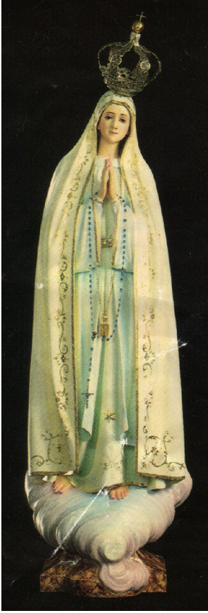
Blessed Virgin Mother