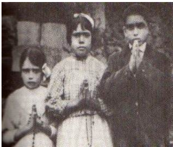
Jacinta Marto, Lucia Dos Santos and Francisco Marto True picture of the three children of Fatima, Portugal. (L to R)

Imprimatur: Patrick Joseph Cardinal Hayes Appointed in 1919 Archbishop of New York Appointed in 1924 Cardinal-Priest of S. Maria in Via Died on Sep 4, 1938