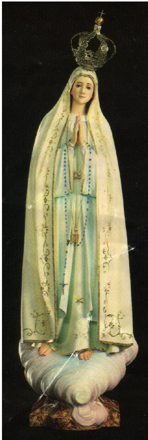
Blessed Virgin Mother